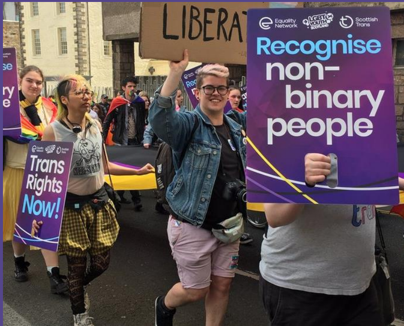
BBC News, 22 June 2019